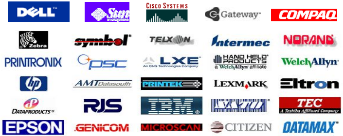
All trademarks are the properties of their respective owners.

Systems, Workstations, Servers, Printers, RF Equipment, Routers, Hubs, PCs – they all have to be maintained. There are often hundreds, even thousands of multi-vendor devices, spread across varied geographies. Wouldn't it be nice to have one integrated service contract, with one invoice, and one organization to call regarding all billing questions and pricing issues?